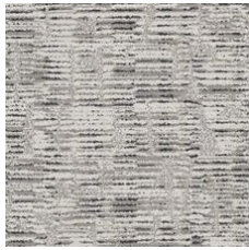
Argan 01100 LRV 32.4