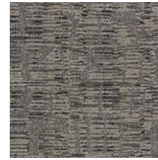
Riad 01518 LRV 12.5