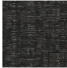
Henna 01585 LRV 3.8