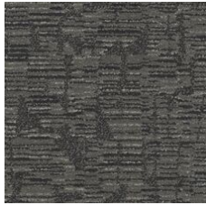
Blended 01555 LRV 8.8