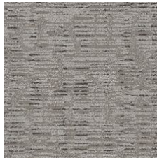
Wool 01105 LRV 19.2