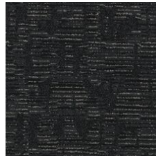
Souke 01500 LRV 3