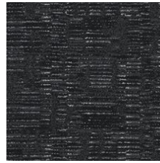
Medina 01505 LRV 4.5